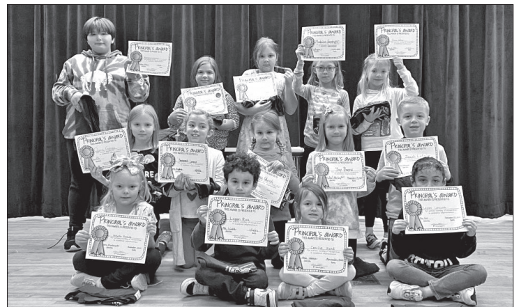
Principal's Award Winners.