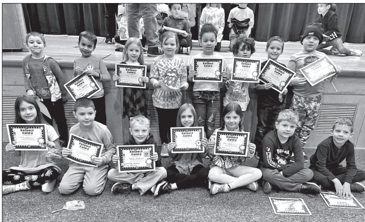
Respect Award Winners.